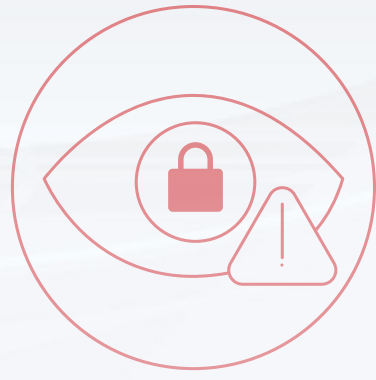
IPS / IDS