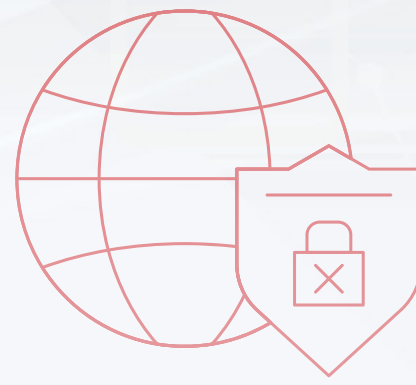
HTTP / HTTPS WEB Filtering